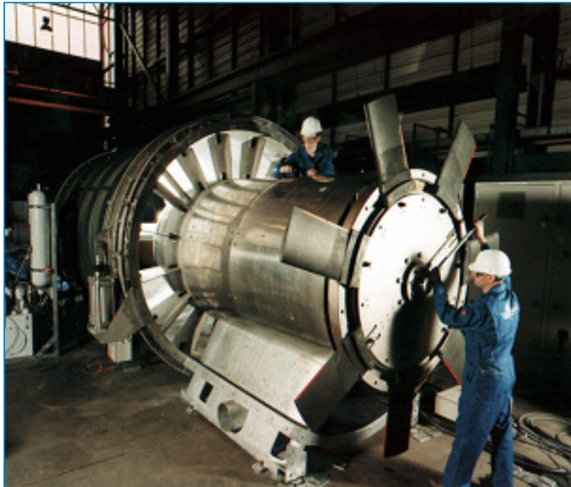
250kW Wells Turbine rotor assembly showing the fixed blades

The LIMPET (Land Installed Marine Powered Energy Transformer) is a second-generation 500kW shoreline Wave Energy Collector located off the west coast of Scotland.