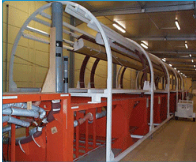
Figure 1: Full scale test rig

The development of this design methodology has led to particularly good correlations between Flowmaster simulations and the test data.